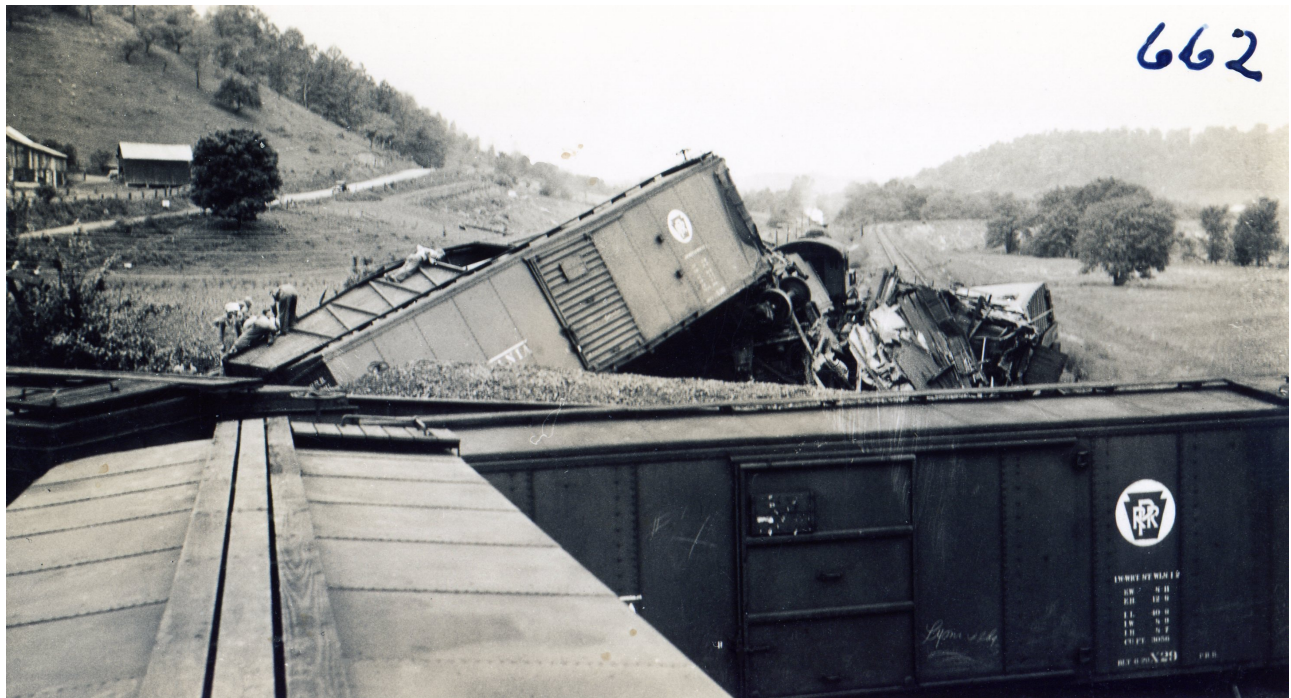
A northbound look at the accident. The track going to the right is the new line to the new Liberty tunnel. The line straight ahead is the old line to Birds Run. Both came together at Guernsey.

Fortunately there were no fatalities, though five were injured, all of whom were riding in the engines. Wreck trains arrived from both Dennison and Cambridge to start the cleanup. An investigation was also opened (#2274). As expected the cause of the accident was due to a siding switch being inadvertently left open.