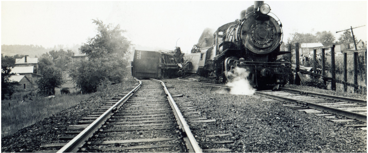
Looking south, we see the lead H-6sb on the ground.