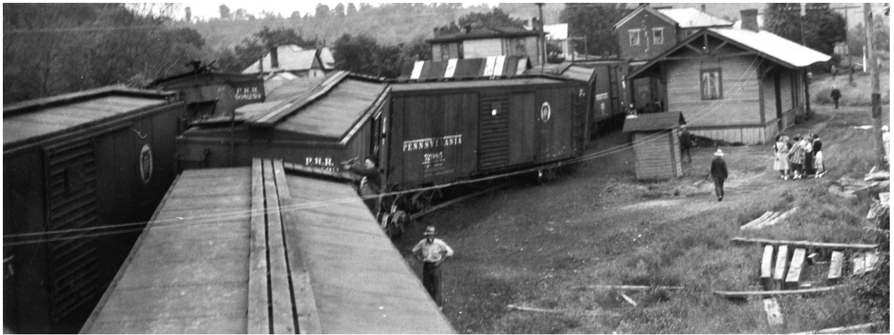
Looking south at Kimbolton depot.