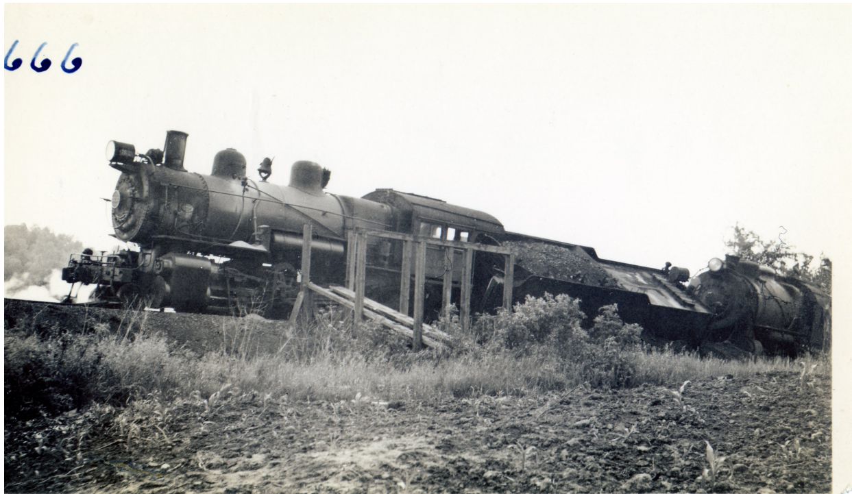
The lead H6 came to rest next to a cattle loading ramp.